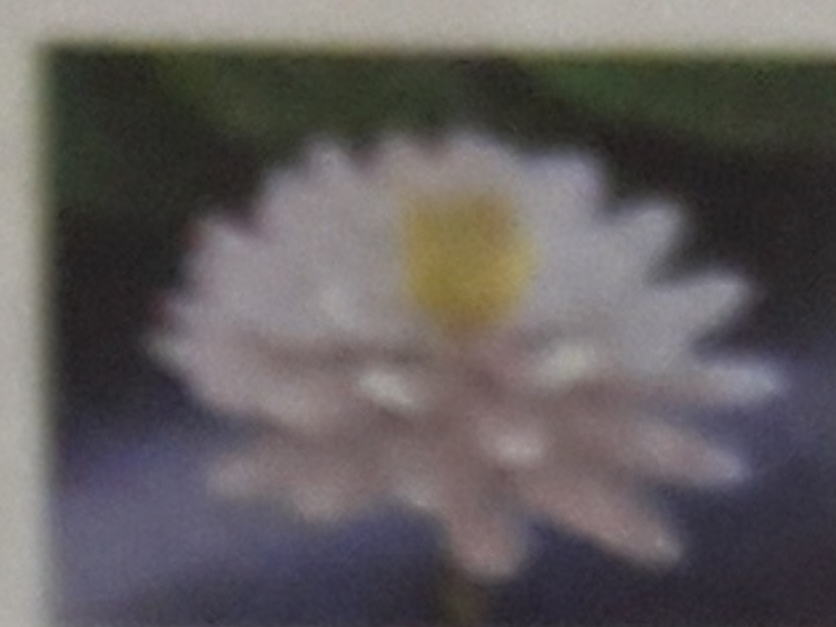
28-03-12 19:34 Lotus

What's better? It depends on you. Nobody can decide for you. It depends on the relationship you have with your parents. It depends on your student loan too because it's usually cheaper to stay at home. Above all, it depends on the course you want to study. Find out which is the best university for your subject. Maybe they don't teach it in your home town. Find out details about the course, the tutors, assessment, etc and compare them with other places. What facilities has the university got for undergraduates? Choosing the right university is a really important decision. It can change your life. Don't make your decision without thinking about the really important issues.